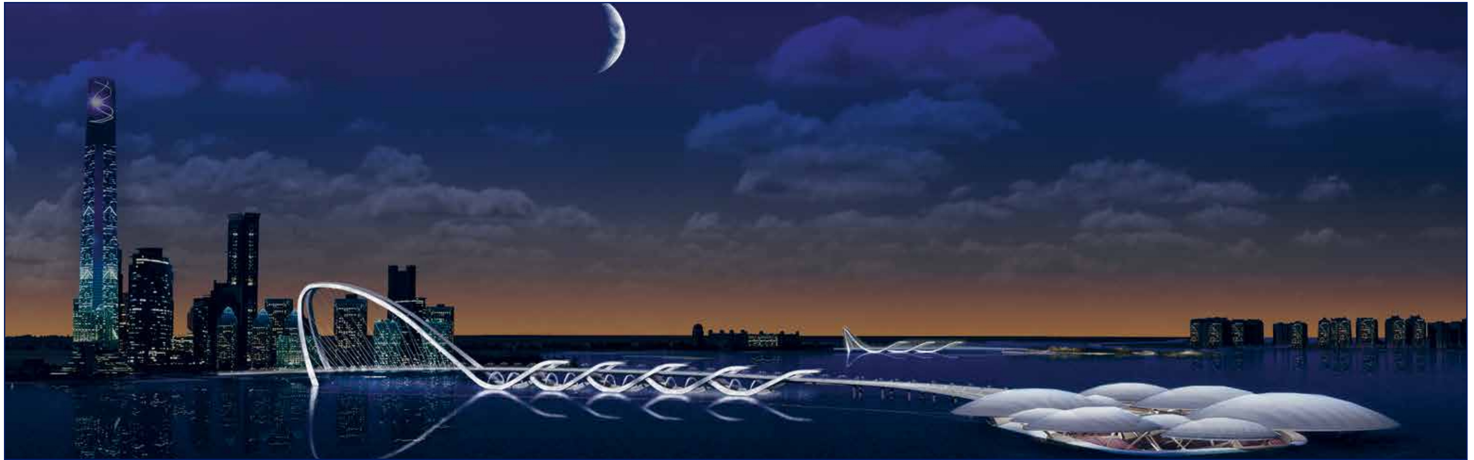
perspective of bridge in doha bay with city in background

This competition entry was short-listed as one of two finalists for this prestigious project. Located in Doha, Qatar, Doha Bay Crossing is a set of 3 interconnected bridges spanning almost 10 kilometers. The bridge will connect the city's cultural district in the north, the Hamad International Airport, and the central business district in West Bay. The bridges, which were designed to accommodate as many as 2,000 vehicles an hour per lane, are also flanked by a series of sub-sea tunnels to manage and direct the flow of traffic across the bay.