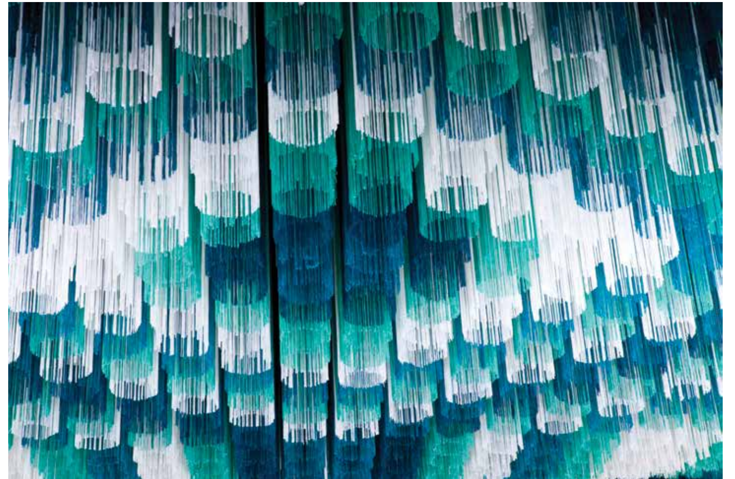
detail of "carpet" ceiling