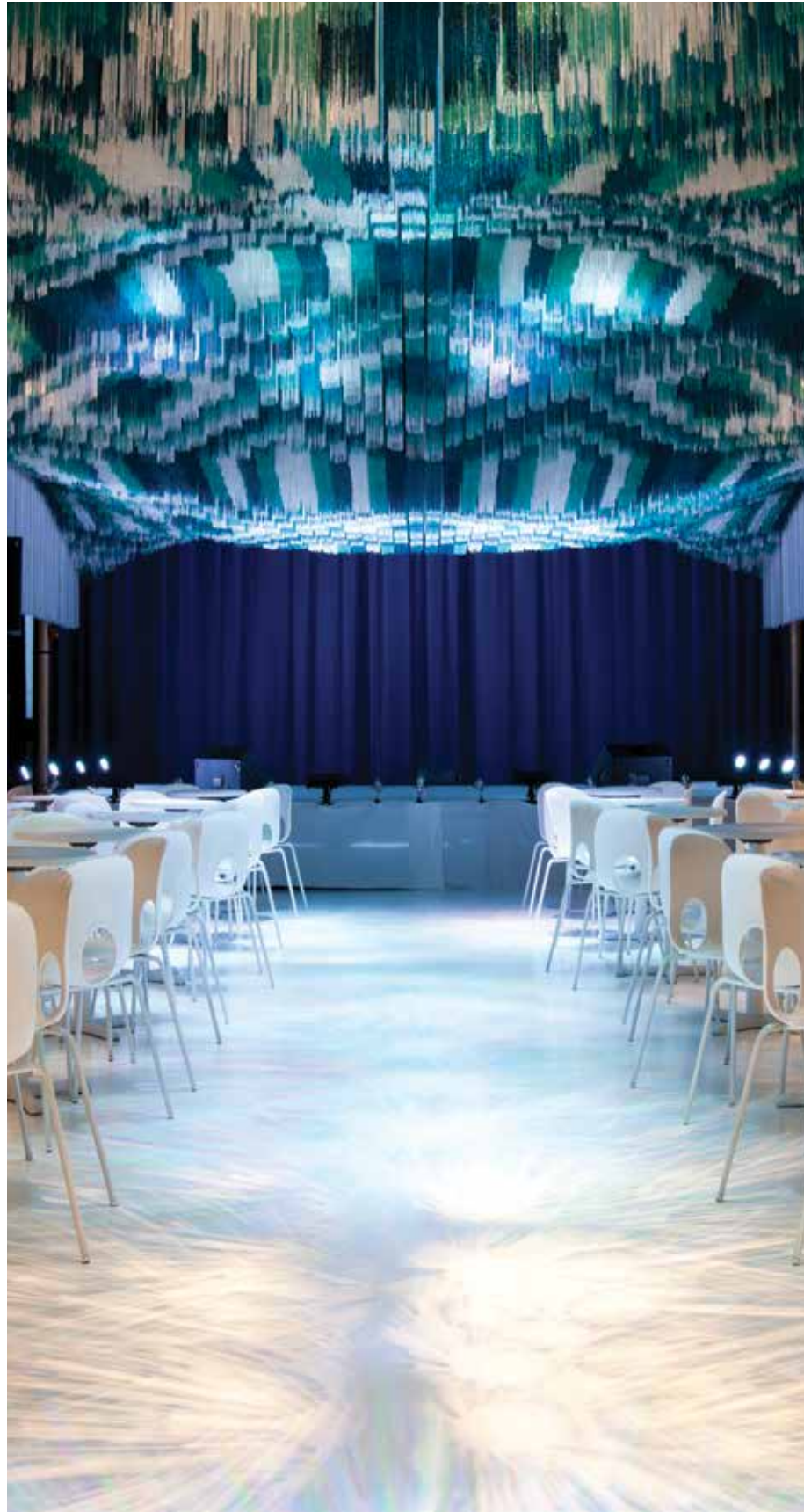
shadows cast by light through ceiling 'carpet'

The Monsoon Club at the Kennedy Center, Washington, D.C. features a large-scale, undulating, illuminated "carpet" hanging from the ceiling. Inspired by the beautiful light during torrential monsoon rains, the lighting and installation do a romantic dance. Its pattern is composed of vertically hung strings, the lengths of which determine the steepness and shape of the undulations. The illumination of this carpet creates fantastic effects when the vertical strings calculatedly interrupt light beams to cast a flood of variegated shadows on the floor.