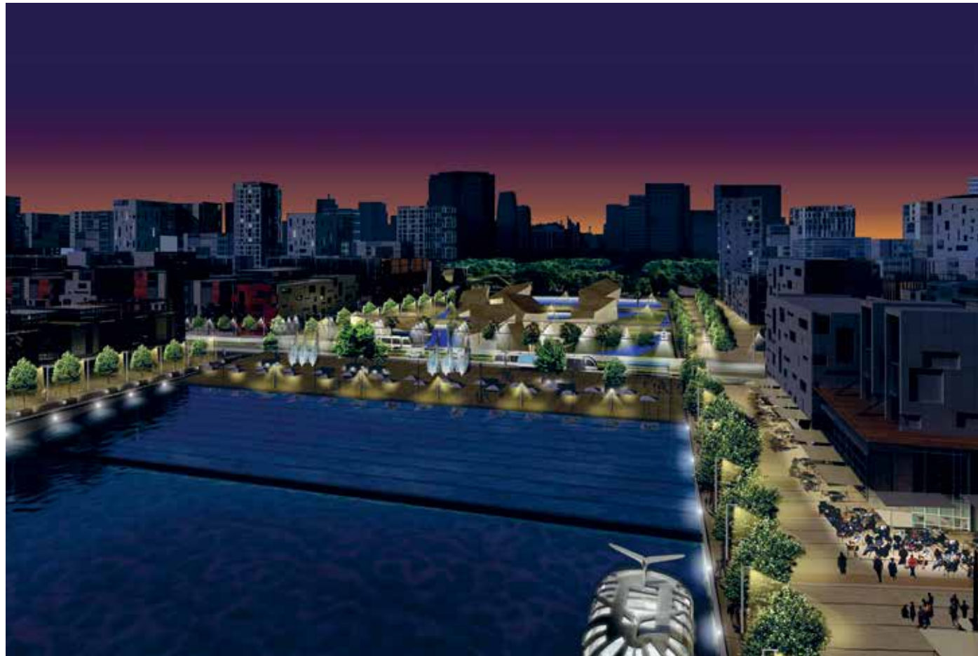
perspective rendering of the wadi